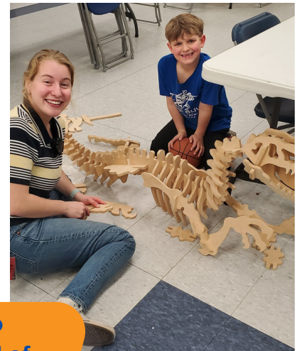
After School Care was given two Velociraptor 3D puzzles by a friend of the congregation. We had fun putting them together!